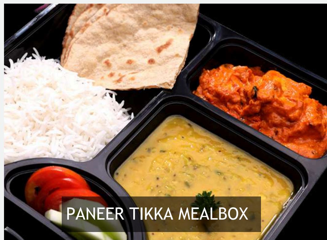
PANEER TIKKA MEALBOX