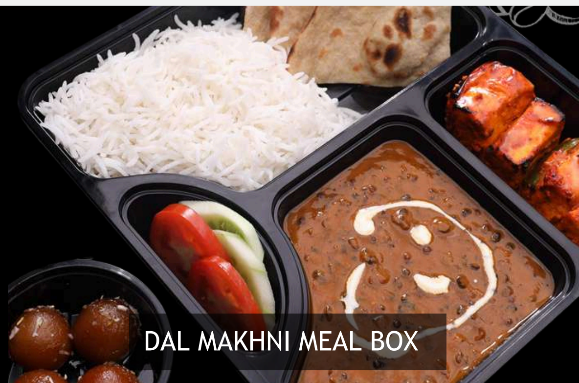
DAL MAKHNI MEAL BOX