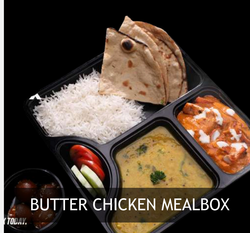
BUTTER CHICKEN MEALBOX