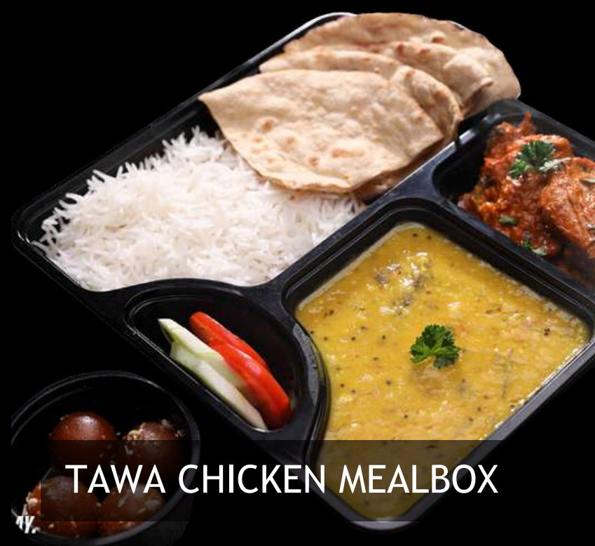
TAWA CHICKEN MEALBOX