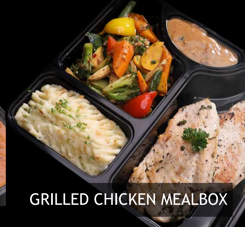
GRILLED CHICKEN MEALBOX