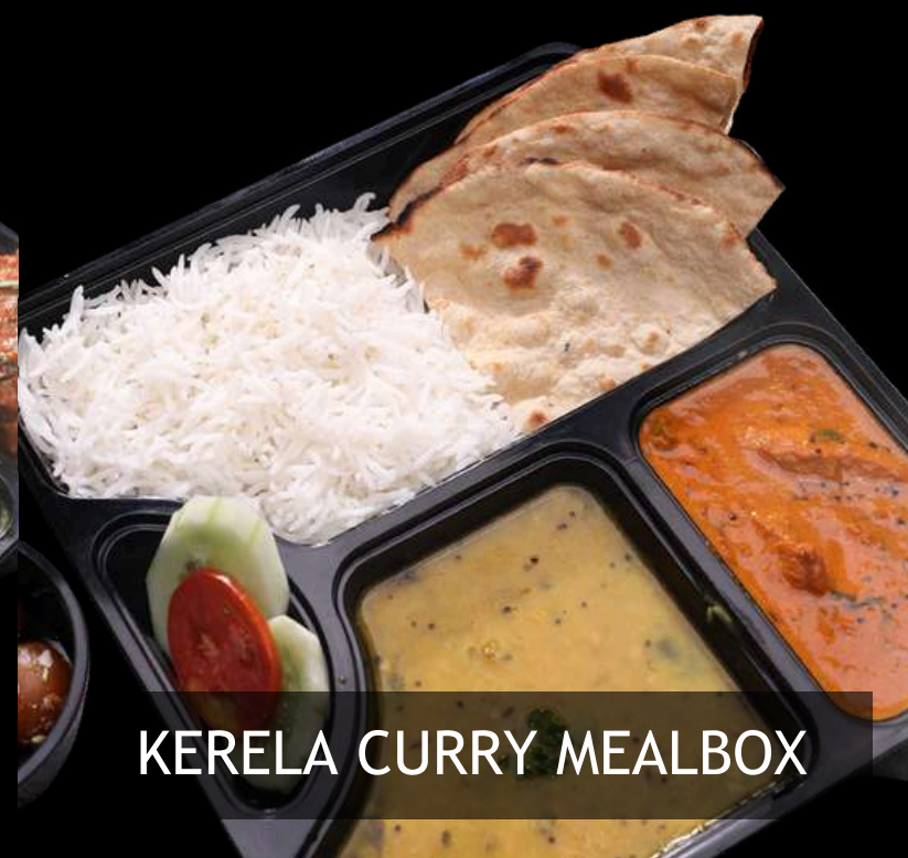
KERELA CURRY MEALBOX