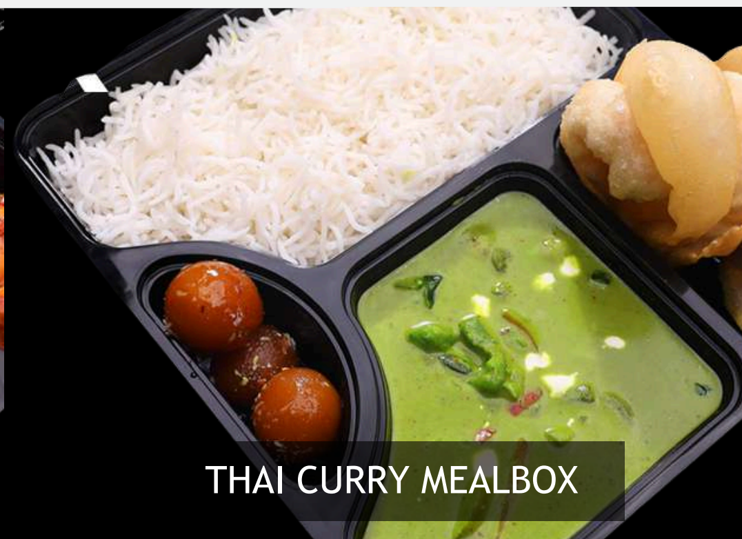
THAI CURRY MEALBOX